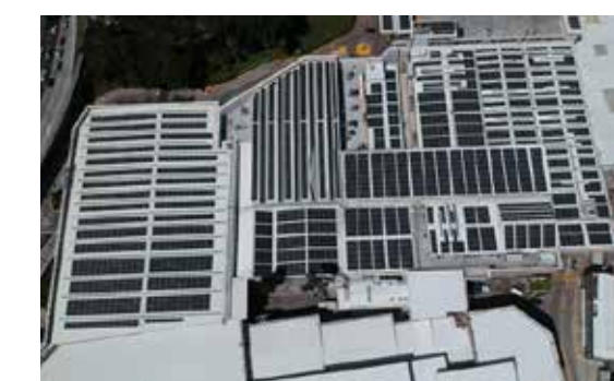
Big Box Stores