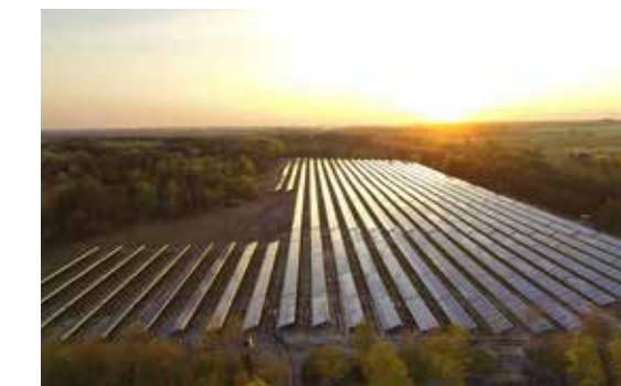
Community Solar/Ground Mount