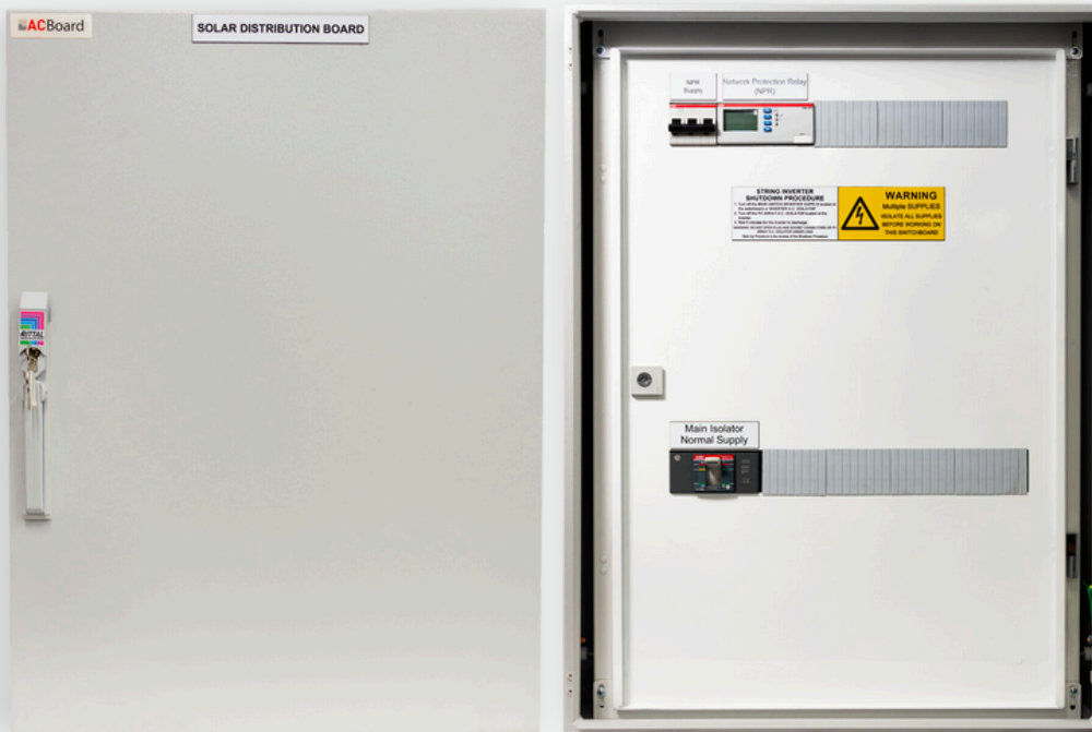
Image is indicative only. Model may differ from image while maintaining functionality.